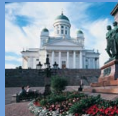
Sibelius is still revered in Helsinki today