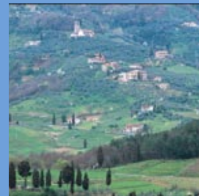
Tuscany – the land of Verdi and Puccini